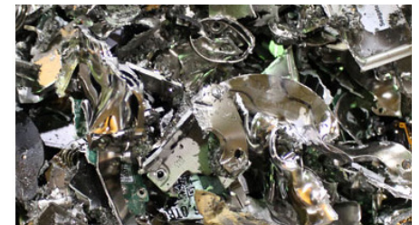
Hard Drive Scraps